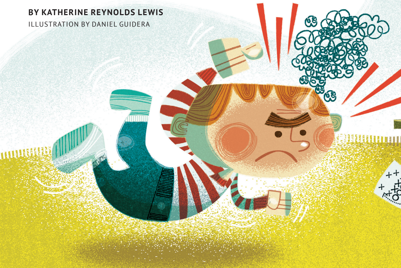
ILLUSTRATION BY DANIEL GUIDERA