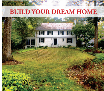
BUILD YOUR DREAM HOME

BRADLEY HILLS GROVE, 1.43 ACRES: $2,349,000