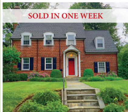
SOLD IN ONE WEEK