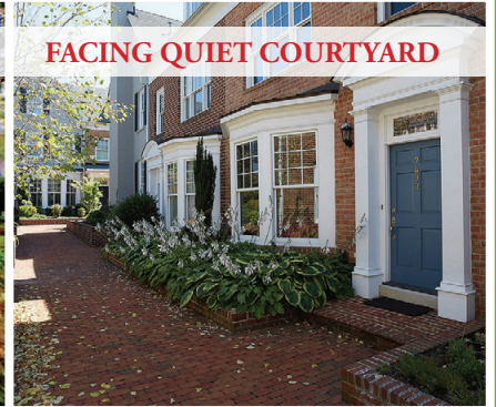
FACING QUIET COURTYARD

BRADLEY HILLS GROVE, 1.43 ACRES: $2,349,000