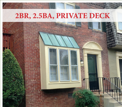
2BR, 2.5BA, PRIVATE DECK