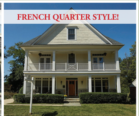
FRENCH QUARTER STYLE!